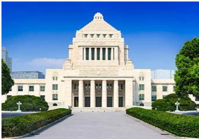
National Diet Building – Tokyo, Japan

Governments can also create or help create public-private partnerships or other stakeholder groups, bringing together diverse groups to discuss and implement opportunities for using AI for climate mitigation. Governments could help fund such public-private partnerships and/or provide the convening power to help assemble and sustain such groups.