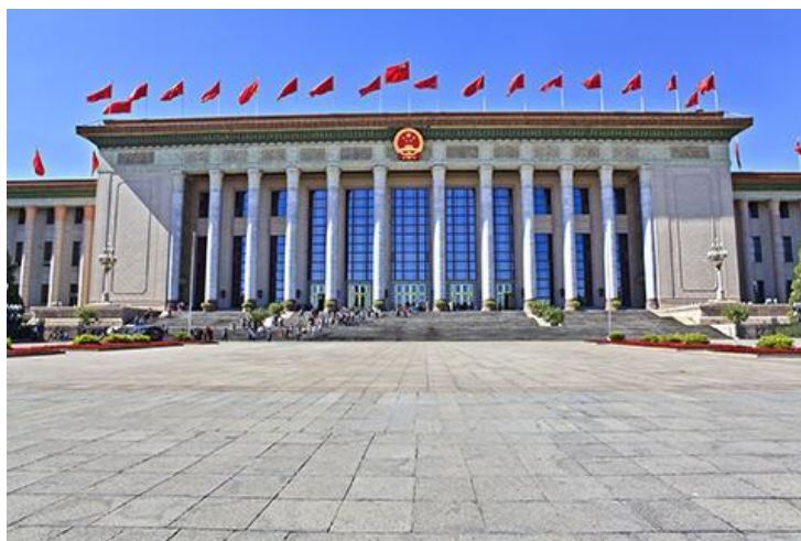
Great Hall of the People -- Beijing, China

Fifth, government agencies working on climate mitigation could systematically review the capabilities of their own staff with respect to AI and launch programs to ensure their staff remain up-to-date regarding AI developments. This could be especially beneficial for grant managers, helping them ensure government funds are disbursed with an up-to-date understanding of AI's potential and attention to AI-related data management practices.