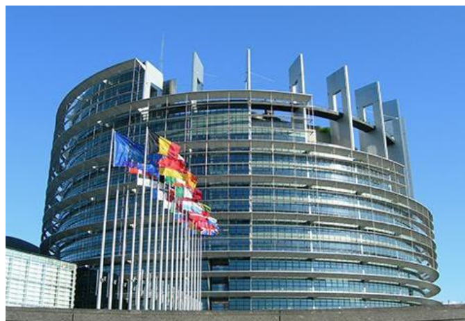
European Parliament -- Strasbourg, France

Governments play an important role in the use of artificial intelligence (AI) for climate change mitigation. Governments collect environmental data used to train AI models, fund clean energy research programs that use AI tools, establish policies that shape the use of AI in the power and transport sectors, and facilitate international cooperation on AI for climate action. Other examples abound.