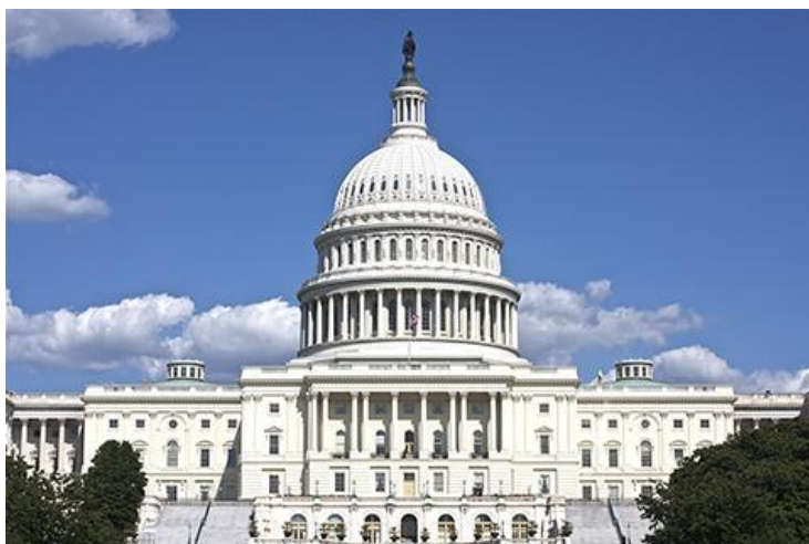
U.S. Capitol -- Washington, DC, USA

Governments can play an important role in addressing these challenges in at least three areas: collecting data, standardizing data and making it interoperable, and addressing the digital divide.