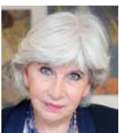
Laurence Tubiana CEO, European Climate Foundation (ECF) Chair of the Board of Governors, French Development Agency (AFD) Professor, Sciences Po Paris France