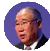
Xie Zhenhua Special Representative on Climate Change Affairs, China