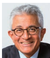
Valli Moosa Former Minister for Environmental Affairs and Tourism, South Africa