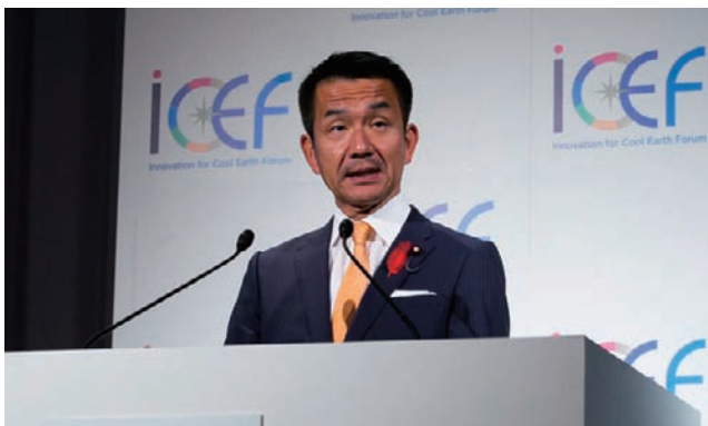
Kiyoshi Odawara Parliamentary Vice-Minister for Foreign Affairs, Japan