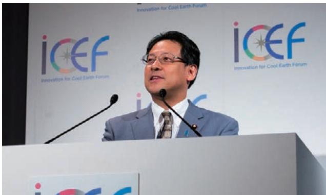
Yoshihiro Seki State Minister of the Environment, Japan