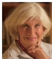
Laurence Tubiana Professor, Sciences Po Paris, France Professor, Columbia University, United States