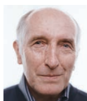
Vaclav Smil Distinguished Professor Emeritus, University of Manitoba, Canada