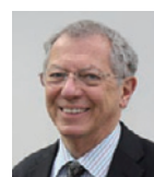
Sir David King UK Foreign Secretary's Special Representative for Climate Change, Foreign and Commonwealth Office (FCO)