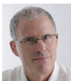
Alan Meier (Chair) Senior Scientist, Lawrence Berkeley National Laboratory

Presentations were given on the background of required energy storage technologies including the off-grid situation and concrete examples of projects for resiliency in the USA. Also, two different manufactures explained their technologies on redox flow battery and hydrogen storage system. In the panel discussion, it was argued that regulatory reform is needed for the penetration of the grid market, while on the other hand, being off-grid is a suitable condition to introduce energy storage technology. It was also pointed out that energy storage technologies should be evaluated not only based on cost but also on benefits provided by each technology.